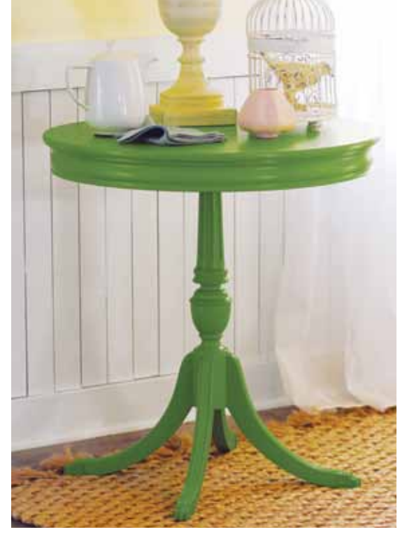
Side Tables: My Sanctuary 27C-6N