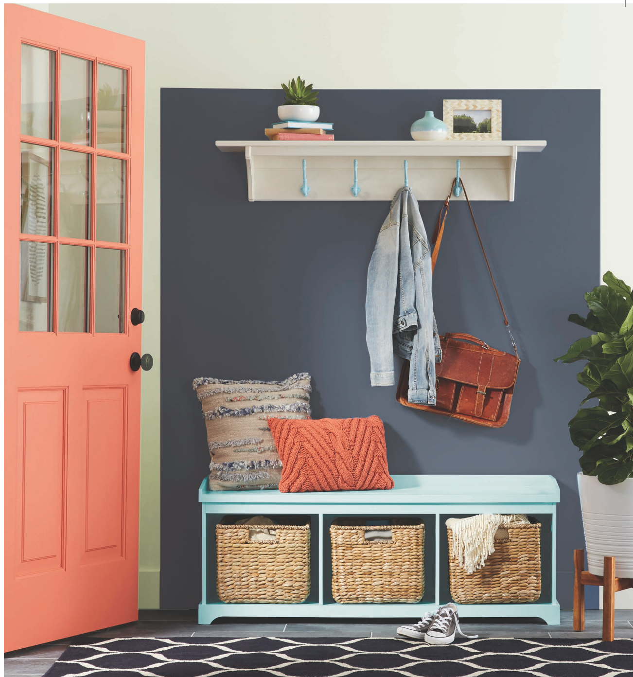
Back light wall and shelf: Light Navajo White CW-W8, Color block: Cast Iron 38A-4 Bench and coat hooks: Illuminated Sky 32C-3, Door: Très Français 09B-5