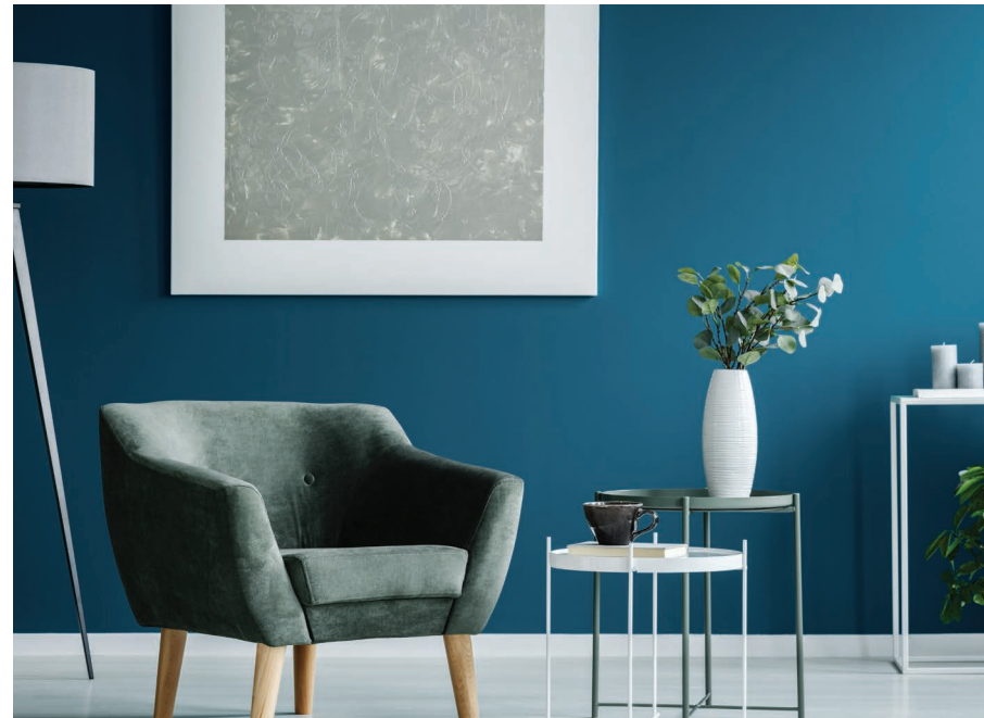
Kitchen Cabinets: Morning Espresso 5038, Walls: Silent White CW-C1, Island: Butterfly 3016, Exterior Door: Green with Envy 29C-6 Bathroom Vanity: Blue Jeans 36C-6, Walls: Designer White 1066, Living Room Wall: Shimmering Sapphire 35B-7