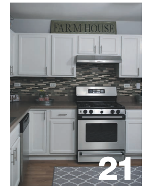
an array of white & gray