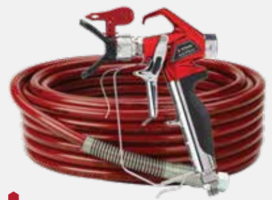
The Impact 640 comes with RX-Pro Gun, 517 TR Reversible Tip and 1/4" x 50' Airless Hose.