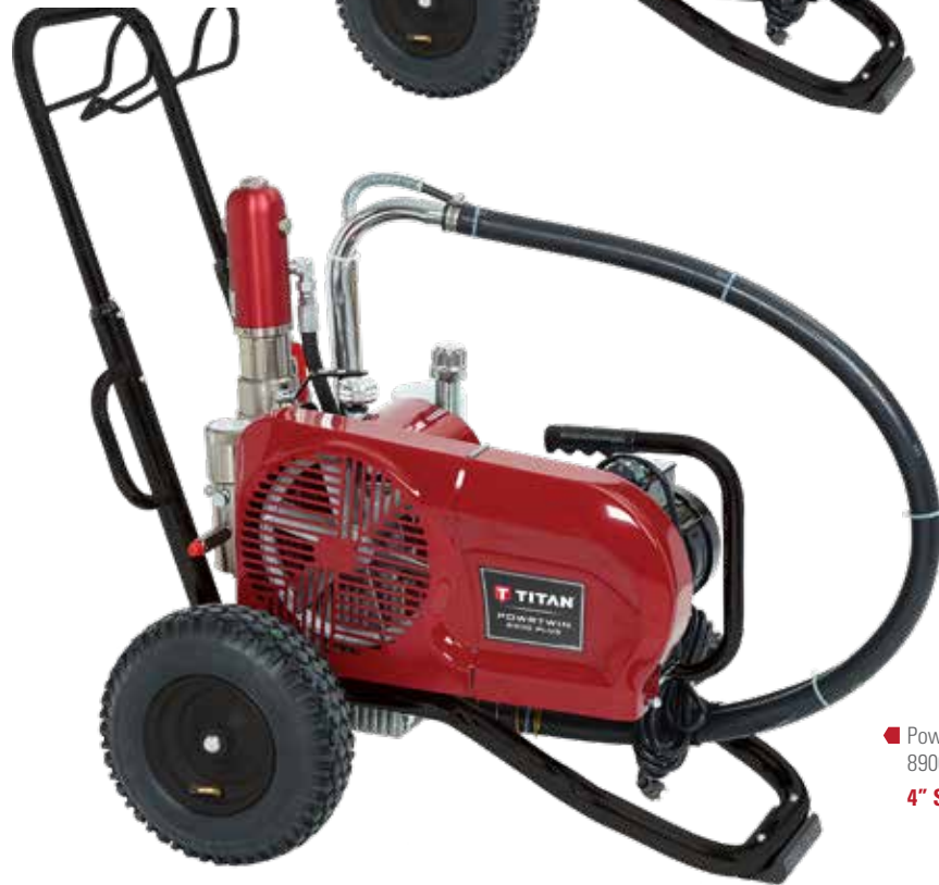
■ PowrTwin 8900 Plus 4" Stroke