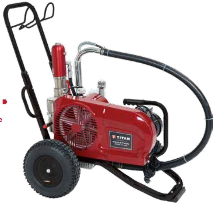
■ PowrTwin 6900 Plus 3" Stroke

■ The 8900 Plus comes with S-5 Gun, 517 TR 1 Reversible Tip and 1/4" x 50' Airless Hose.