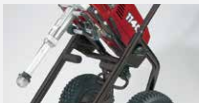
1. Tilt back.