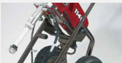
2. Detach quick release hoses.