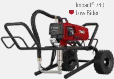
Impact® 740 Low Rider

The Impact 740 is designed for extended, heavy-duty performance on larger residential and commercial projects. This is the sprayer contractors turn to when the time comes to enter the big leagues.