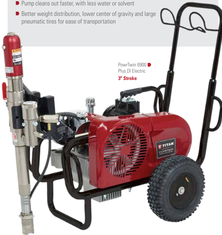
PowrTwin 6900 Plus DI Electric 3" Stroke