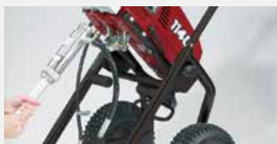
3. Pull handle under body. Slide out fluid section.